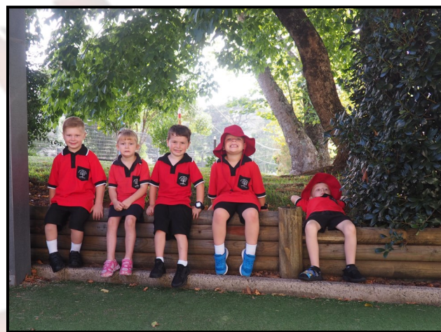
Our New Kinders

We had a wonderful start of week 1 2020. The students have settled in well and especially our Kindergarten students are enjoying their big school journey. We did a time capsule this week with all our students and at the end of the year we will check it again to measure their growth. I would also like to thank all parents for dressing their children in proper school uniform as they all are looking fabulous and the credit goes to you.